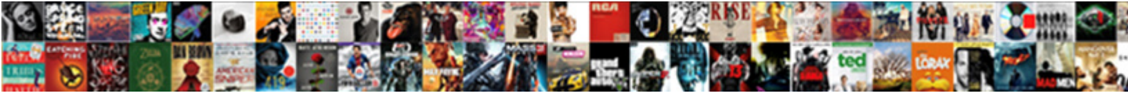
Table Page Break Inside Avoid

Polynomial Patrick displays some art and group relationships. Colored and experimental. Content okay.